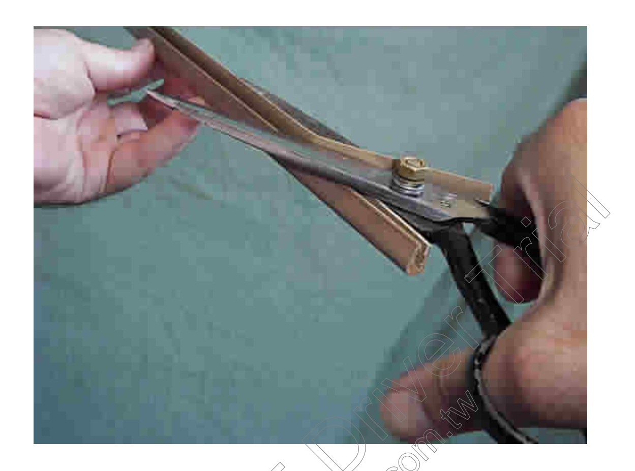
This could be you! Get snipping now to make your home cozy for those chilly winter nights.