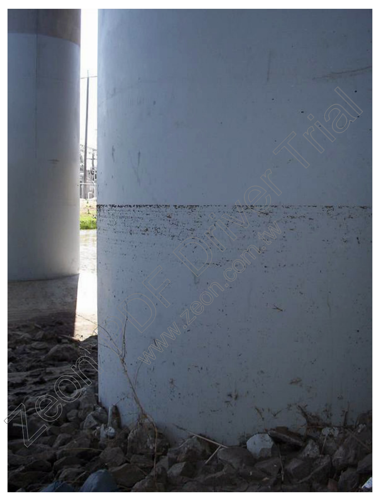
Infrastructure at the terminal staion can clearly be seen between the two concrete columns. Again, the peak flood level mark demonstrates less than one metre clearance between flood height and TS ground level.