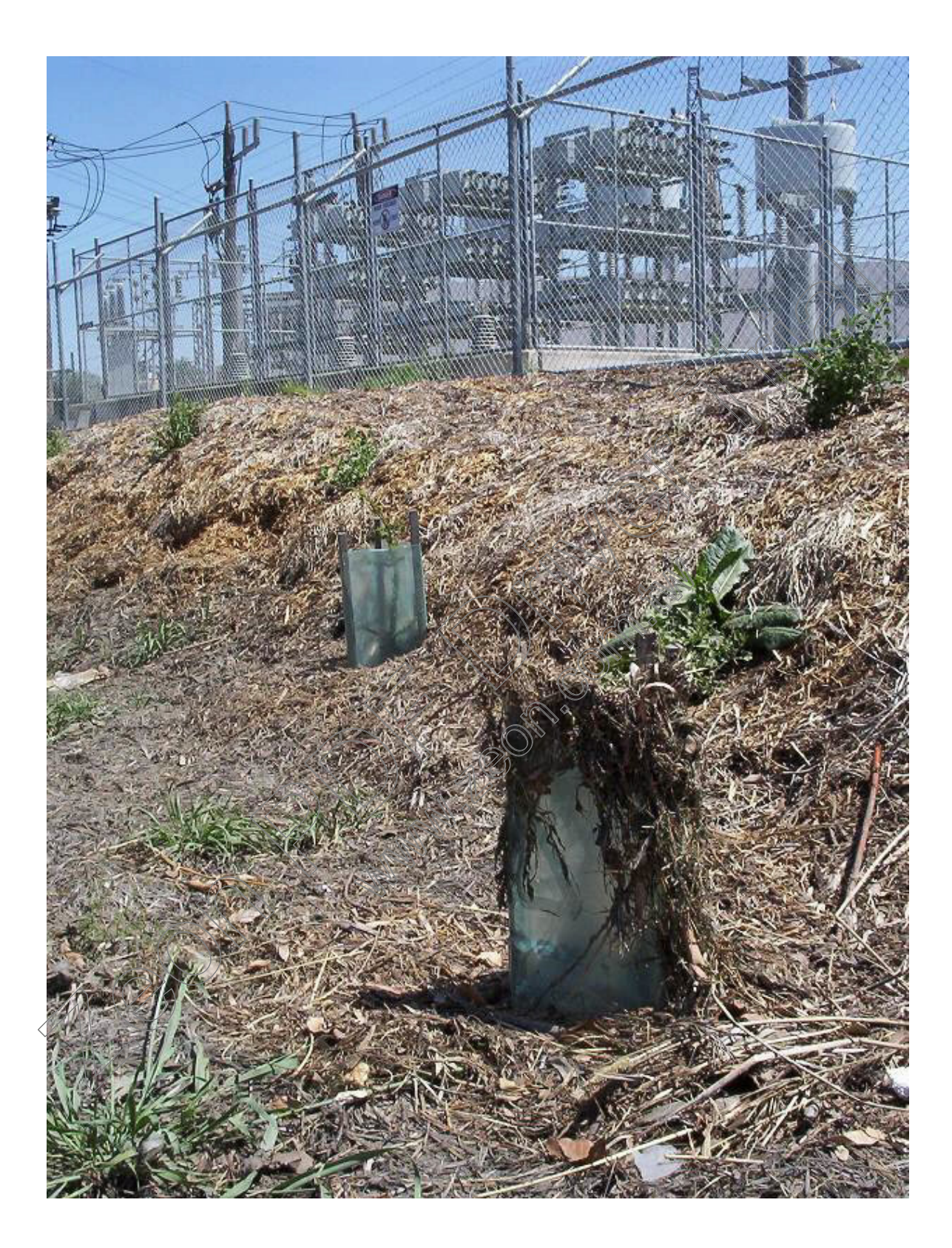
Debris on a tree-guard, about 1.5 to 2 metres below No3. Capacitor Bank